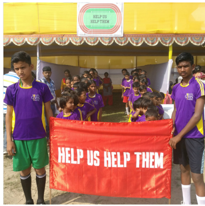
photo next row